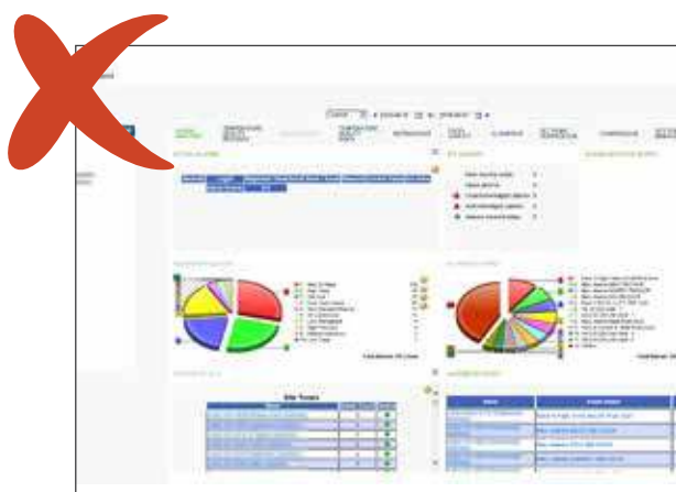
Less appealing as main image