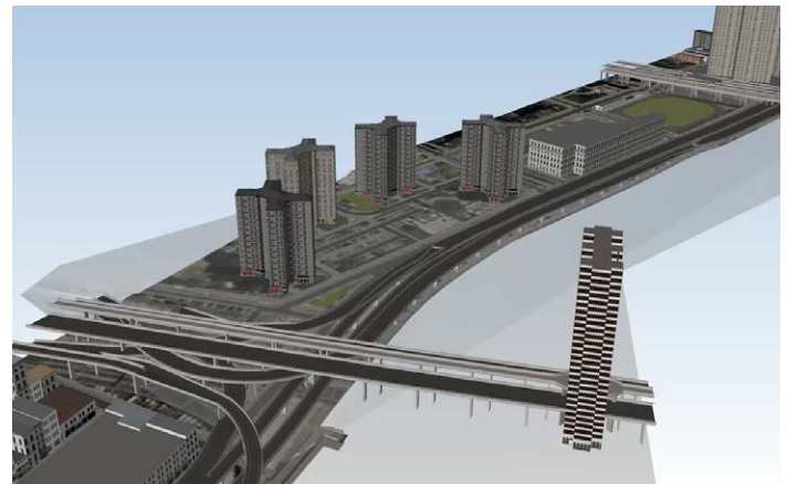
Clear visualization has lowered the time needed for identifying and resolving clashes from 24-32 hours to 8-12 hours, per preliminary data.

Real-time visualization of potential clashes and adjustments in the schedule enables proactive problem-solving, reducing delays and ensuring that the jobsite remained risk free. Their work with SYNCHRO has lowered the time needed for identifying and resolving clashes from 24 to 32 hours to eight to 12 hours per preliminary data. Resolving issues with existing infrastructure, buried services, and other complex elements prior to construction is minimizing on-site disruptions, improving safety, and reducing the likelihood of costly rework or delays. “The flexibility and adaptability of Bentley applications has been allowing us to effectively manage the project’s intricacies and is expected to continue to contribute to its successful execution,” said Talekar.