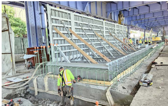
Greenman-Pedersen needed to create intuitive 4D construction planning videos to avoid clashes with complex infrastructure and other development and maintenance projects.

By using SYNCHRO 4D, Jacobs-Greenman-Pedersen Inc. JV significantly improved the understanding of the project and its complex lifecycle, even with multiple changes in construction sequencing throughout development. “The implementation of SYNCHRO 4D contributed to streamlining various project