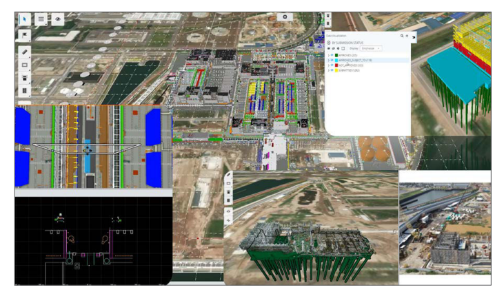
The federated iTwin model optimized collaboration and enabled a structured data environment that helped reduce forecasted capital expenditures by 5%.

The digital solution enabled model-based tendering and a truly federated information model, integrating multisourced 3D information, including photogrammetry to add context to the information model by essentially creating a digital twin to meet the dynamic needs of the project. The iTwin Platform facilitates seamless, real-time access to a federated information