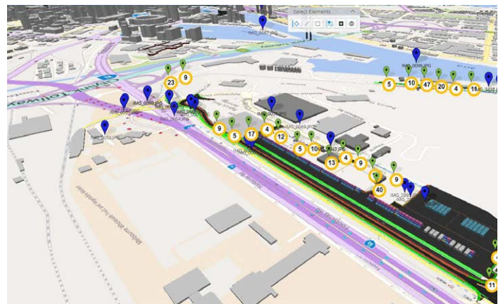
While ProjectWise offered a structured and streamlined environment for managing project information, integrating iTwin further enhanced WSP’s data sharing capabilities, enabling real-time collaboration, visualization, and analysis.

empowering the team to gain valuable insights, identify clashes, and make informed decisions in a virtual environment. By seamlessly integrating various data sources and models, WSP achieved real-time collaboration that saved 12 days on their PRTP project. “The combination of ProjectWise and iTwin proved to be a game-changer for the PRTP, delivering enhanced outcomes while maintaining the project’s stability and connectivity within a larger portfolio,” said Ymmas. Using the PRTP as a digital-centric case study, WSP also saved 300 resource hours, reducing rework.