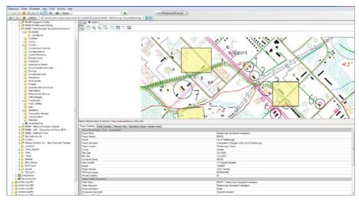
Easily navigate project data by spatial location to retrieve all required content.

ProjectWise encompasses a growing list of complex software artifacts, as many firms need to integrate information from upstream systems before