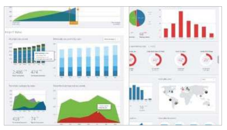
Increase project transparency and zero in on potential bottlenecks.

Design review capabilities allow users to create, assign, publish, and collaborate on issues related to markups within a PDF document from a project's Issues Registry, or within a federated iTwin<sup>®</sup>. Without automated workflows that streamline collaboration, organizations waste time and money, and their designs are not accurate.