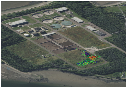
See design data in context for collaborative design delivery and review.