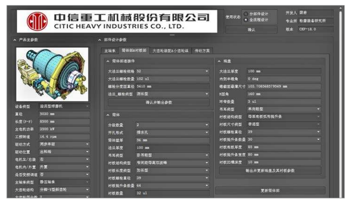
Using Bentley applications, Citic created a digital construction management system, reducing construction time by 7%.

operations. This process facilitated online, intelligent equipment monitoring and diagnostic services, establishing a preventive maintenance system that enhanced operational safety and improved equipment reliability. Through Bentley's integrated, cloud-based applications, Citic produced accurate 3D models of the entire main equipment and can now digitally monitor plant equipment and processes, achieving whole lifecycle BIM management from design through delivery and operations.