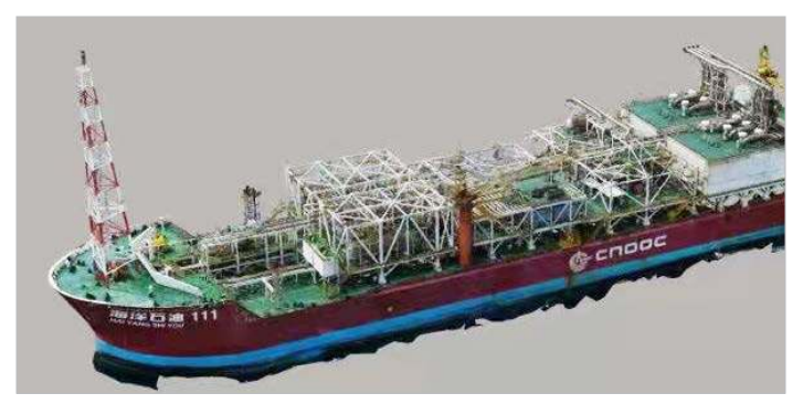
CNOOC relied on Bentley's open 3D and reality modeling applications to generate a 3D reality mesh and digital twin of an FPSO oil platform in the South China Sea.

Bentley's collaborative digital solution provided a breakthrough integrating multiple core data sources, including 325 videos, 7,498 images, and 844 point clouds to generate an accurate 3D reality mesh. "[Bentley's] reality modeling software can effectively organize different types of source data for the establishment of reality models," said Shi. Integrating OpenPlant for 3D structural modeling, they superimposed the engineering model with the reality model to determine risk areas and operation and maintenance conditions, ensuring facility safety.