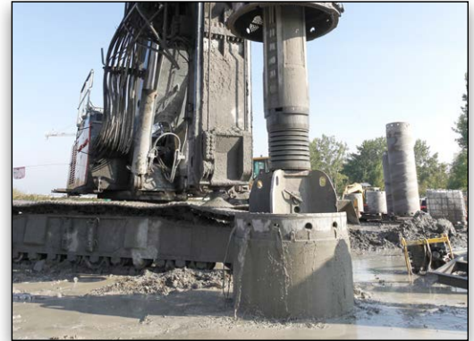
ProjectWise's collaborative environment improved efficiencies and enabled Hatch to complete the detailed design on time and within budget.

Hatch realized early on that they needed software that combined computer-aided design with engineering analysis to ensure the success of this project. Besides overcoming the multiple, complex challenges around the project's construction, they also needed to minimize costs while considering the underwater soil and environmental features. Also, as the treatment plant services about 1.6 million residents, the final result needed to ensure an enhanced quality of life for the community, as well as any future residents as the city grows and expands.