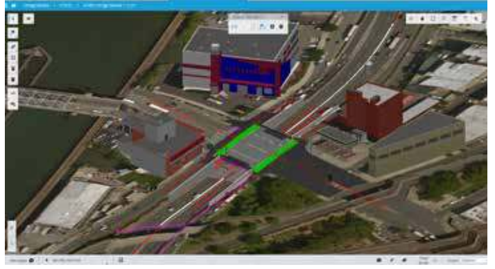
Using iTwin Design Review provided an integrated digital environment for more than 180 reviewers across 15 agencies to optimize design review and change management.

familiar with Bentley applications, NYSDOT selected OpenBridge Modeler, ProSteel, and MicroStation to develop a 3D model of the entire bridge structure to a level of detail that contractually enabled the team to build directly from the model, without requiring the aid of a complete set of 2D plans. The interoperability of Bentley's modeling software enabled NYSDOT to directly reference the highway designers' OpenRoads alignment file in the 3D bridge model, ensuring positional accuracy. Integrating iTwin Design Review to the project allowed more than 180 reviewers across 15 agencies to easily access and comment on the model in a digital environment.