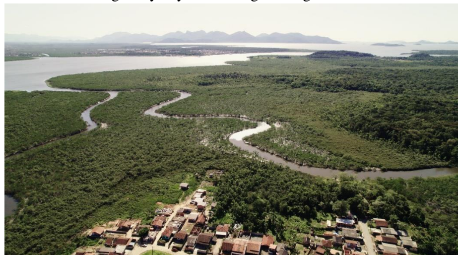
Companhia Águas de Joinville developed a contingency plan for droughts, recognizing that access to water means dignity for the people in the community.

• Companhia Águas de Joinville (CAJ) – The second film features Companhia Águas de Joinville (CAJ), in Joinville, Brazil, a city that experiences seasonal droughts, but in recent years has been experiencing some of the worst droughts in 30 years. Drought and water scarcity has a huge social impact on people's lives. Access to water means dignity for the people in the community. The hydraulic model and the digital twin help to evaluate how well the system is working, as well as check the changes that can be done within the system to figure out what the response will be. The outcome can sometimes be surprising. It is not just about the engineering; it is about the impact that it has and the connections that go way beyond the engineering work.