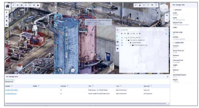
Observe conditions that may be encountered on surrounding areas where work is being planned.