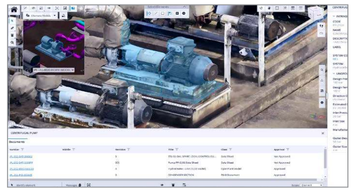
The reality model of a facility provides a clear presentation of the actual site.