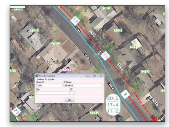
Multiple search capabilities allow field personnel to find information quickly.