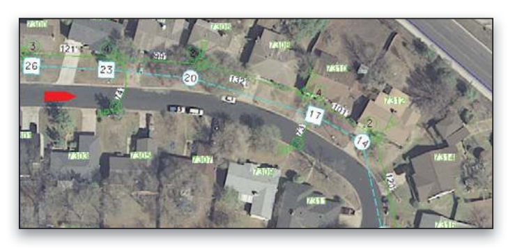
Integrated imagery helps technicians plan work and interpret network maps.

Network maps can be overlaid with georeferenced imagery that helps field personnel locate work sites, plan jobs, and add context to redlines. High performance binary and continuous-tone raster display ensures fast application response.