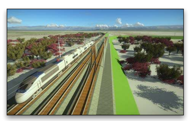
Create stunning photo-realistic visualizations in seconds using dynamic immersive visualization capabilities.