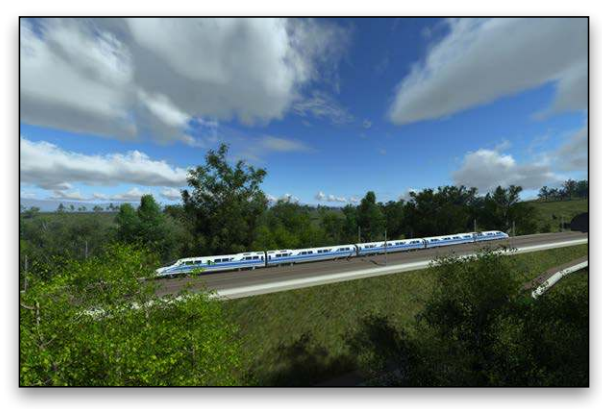
China Rail High Speed Rail Track