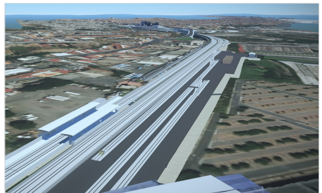
OpenRail, OpenRoads, and OpenCities Map improved accuracy by allowing designers to integrate track, civil, and GIS data in a single design format.

Bentley ® FIND OUT MORE AT BENTLEY.COM Advancing Infrastructure