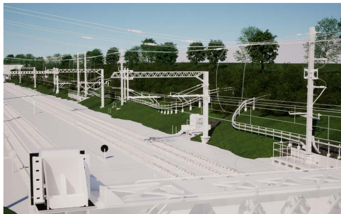
SPL created a custom data source within ProjectWise to efficiently send and receive information to 20 design organizations, helping to meet the unique requirements of the project.

Some projects used multiple applications for their common data environment. But by adapting ProjectWise as a single connected data environment with the addition of SPL Powerlines' customized data source, project data quality