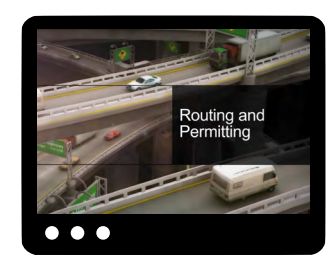
ROUTING AND PERMITTING